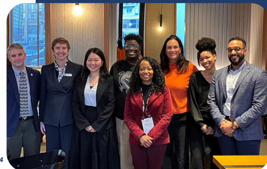
NOAA Meet & Greet Thursday, December 12, 2024 Washington, DC