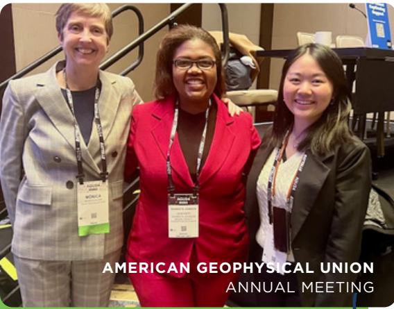
AMERICAN GEOPHYSICAL UNION ANNUAL MEETING